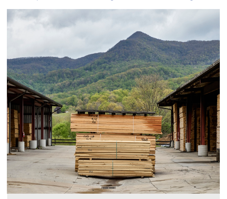
The UK, the largest European export market, was down 40% in volume to 61,181m<sup>3</sup>, but still accounted for a third of all shipments to Europe this year.

U.S. hardwood lumber exports have fallen in almost all European markets this year. The UK, the largest