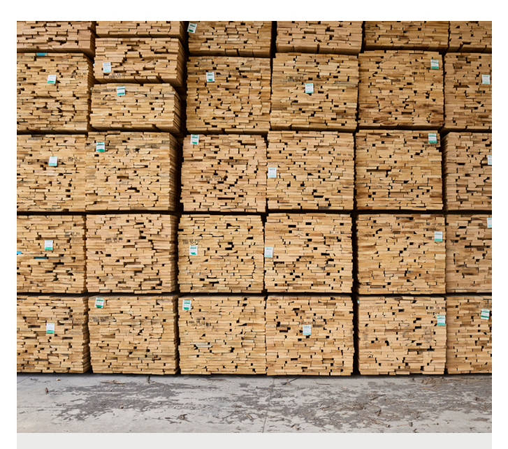
Once the EUDR conformance procedures are in place, they will be integrated with, and used as a runway for, those U.S. hardwood operators that want to voluntarily commit to the SHC sustainability standards.