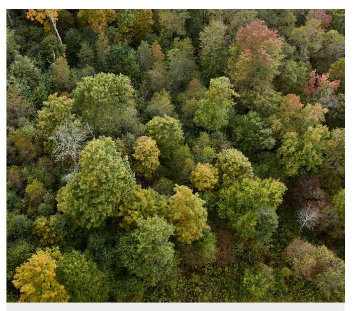
In delivering against EUDR, AHEC/SHC aim to exploit the ready availability of good quality property boundary data and satellite data in the U.S.

In delivering against EUDR, AHEC/SHC aim to exploit the ready availability of good quality property boundary data and satellite data in the U.S., along with the EU's apparent acknowledgement that operators may provide all "potential" plots of land from which wood may have been derived in each consignment.