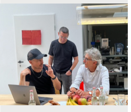
AHEC EXPLORES NEW STRATEGIC PARTNERSHIPS IN GERMANY