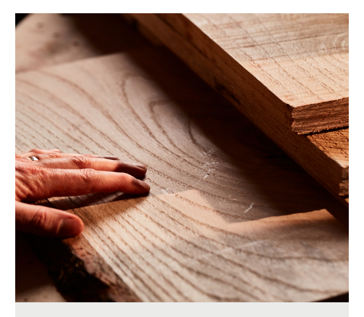
Looking at species, red oak fares well, falling back 21% to 26,035m<sup>3</sup>, which is still more than was shipped in the whole of 2020.

market, was down 40% in volume to 61,181m<sup>3</sup>, but still accounted for a third of all shipments to Europe for this period. Germany and Italy also saw sharp falls of 48% and 44% respectively. Shipments to Spain fared better, down 19% to 24,475m<sup>3</sup> for the January to July period compared to last year, making it the second largest market. The only markets in Europe that didn't see exports fall were Portugal (11,055m<sup>3</sup>) and Greece (4,547m<sup>3</sup>), where shipments remained unchanged from last year, and Cyprus, where volumes more than doubled albeit from a relatively low base to 1,476m<sup>3</sup>.