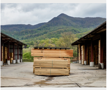
U.S. HARDWOOD EXPORTS TO EUROPE DROP SHARPLY AS DEMAND WEAKENS ACROSS MOST MARKETS