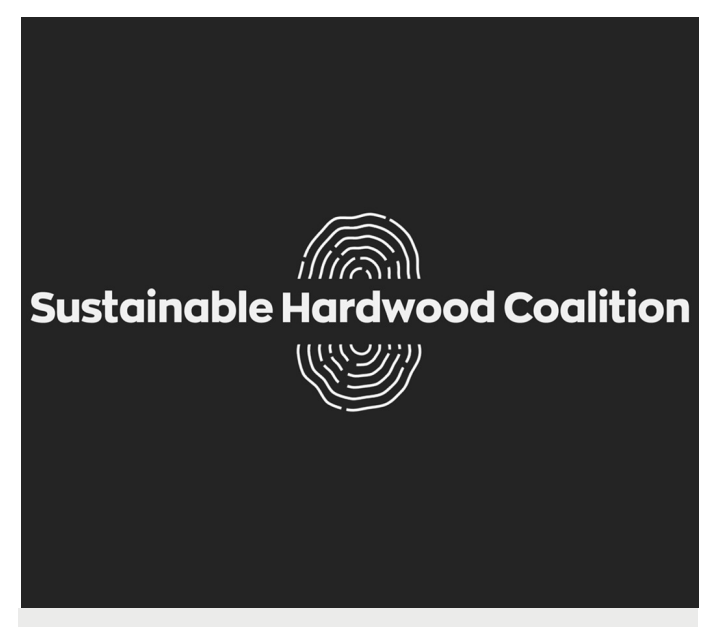
In a new phased approach, the priority in the SHC strategy is to implement a set of procedures that will enable U.S. hardwood suppliers to conform to EUDR.

The priority is to implement a set of procedures that will enable U.S. hardwood suppliers to conform to EUDR, including requirements for geolocation to the "plot(s) of land" where harvesting takes place, legal harvesting, and zero risk of deforestation and forest